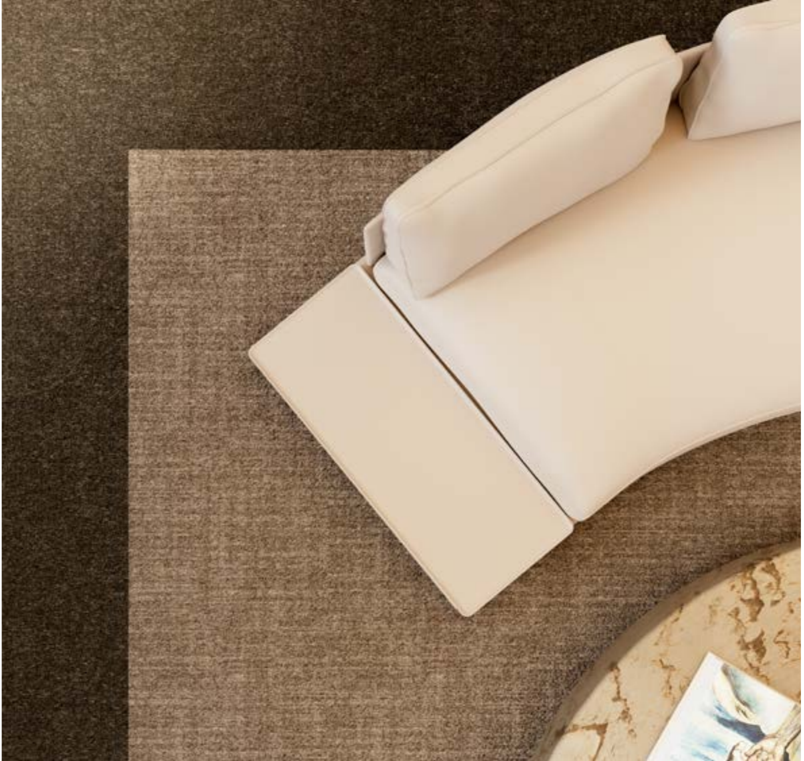
ARTUS 848, FORMA 991