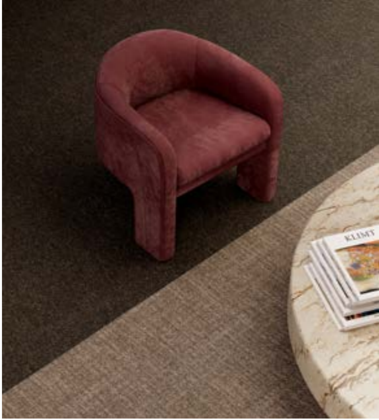
ARTUS 848, FORMA 991