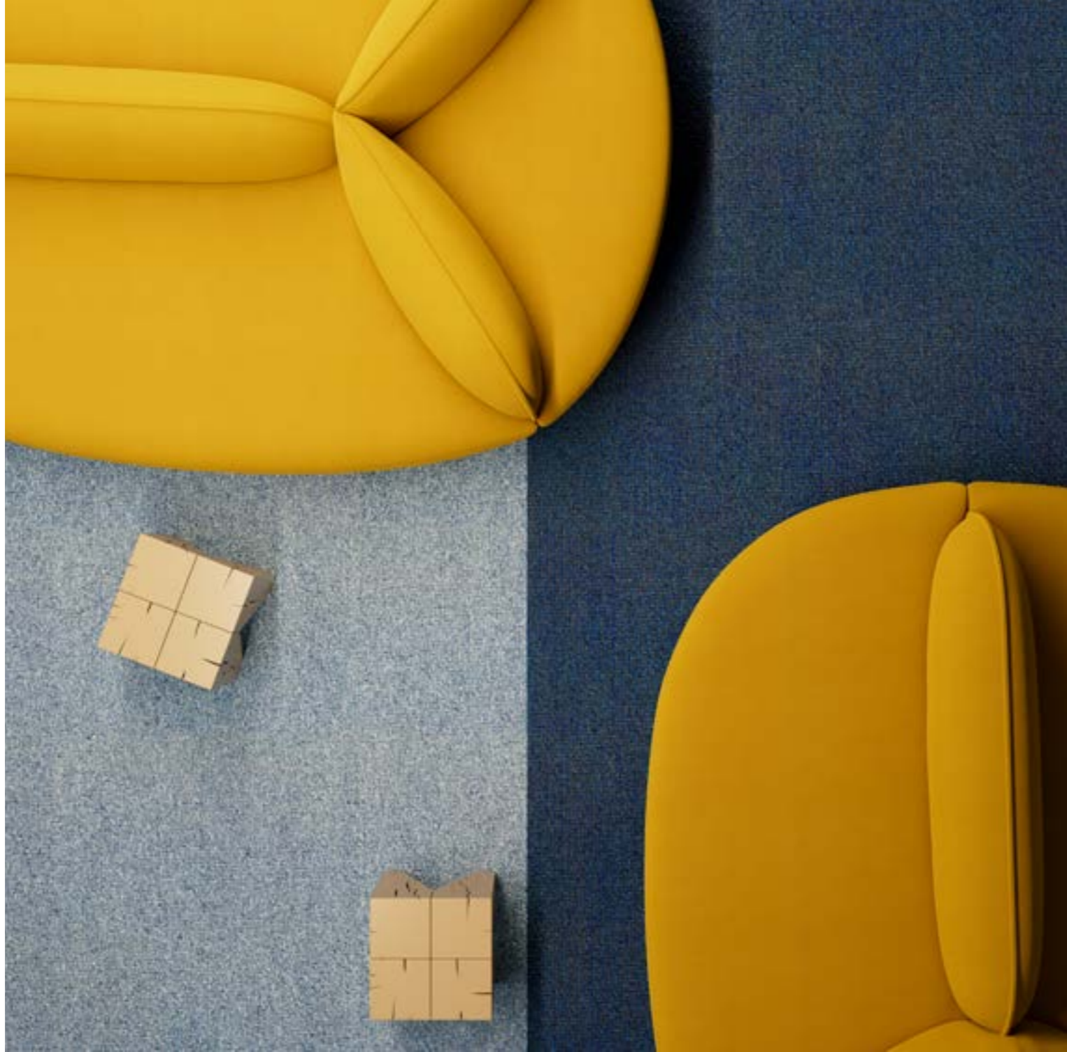
TEXTURA 517, TEXTURA 592