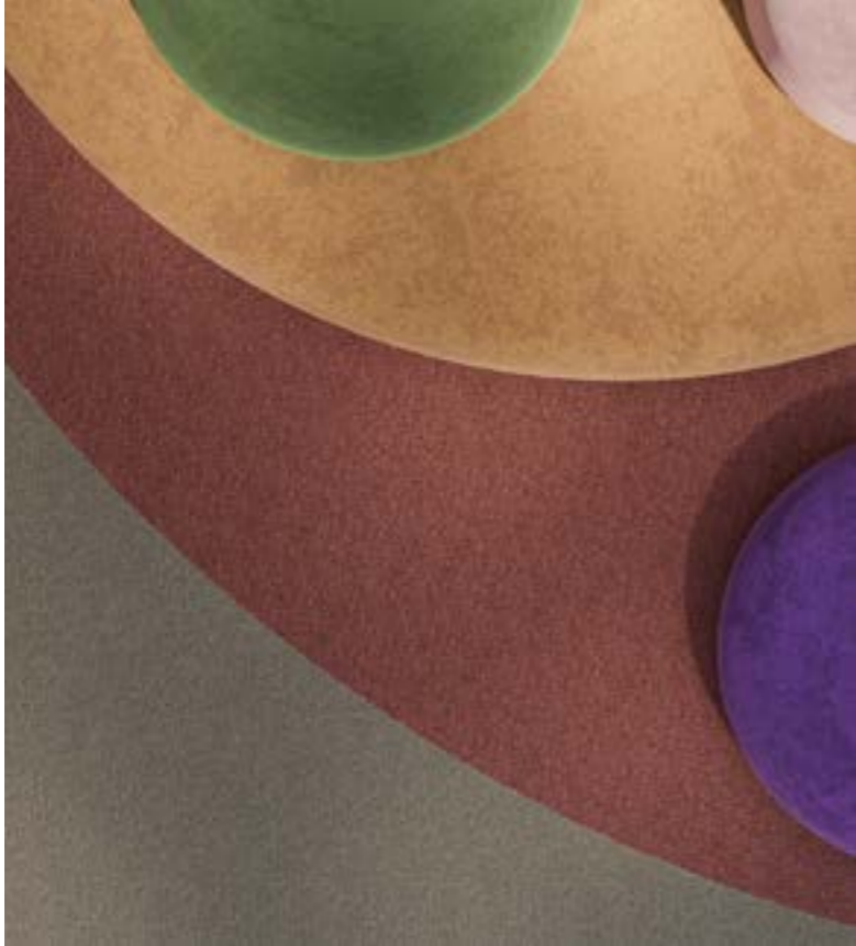
MONOS 642, MONOS 326