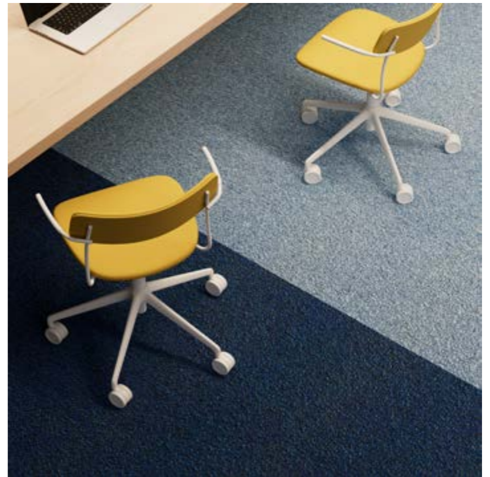
TEXTURA 517, TEXTURA 592