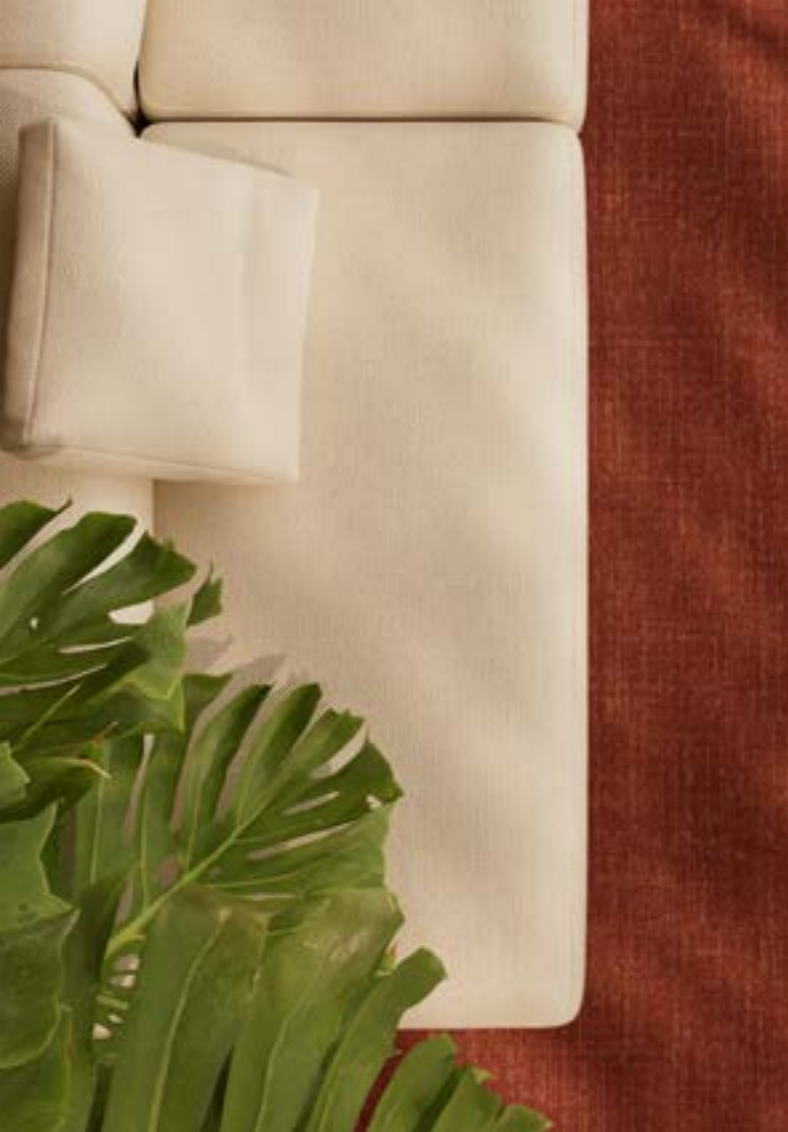
ARTUS 346, FORMA 968

Plus' collections—Monos, Artus, Forma, and Textura—complete your design. From moodboard to realisation, these collections elevate any style or mood you envision.