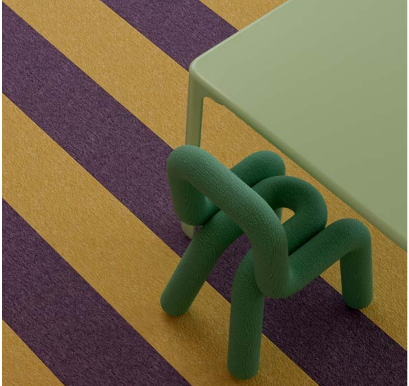
MONOS 452, MONOS 204