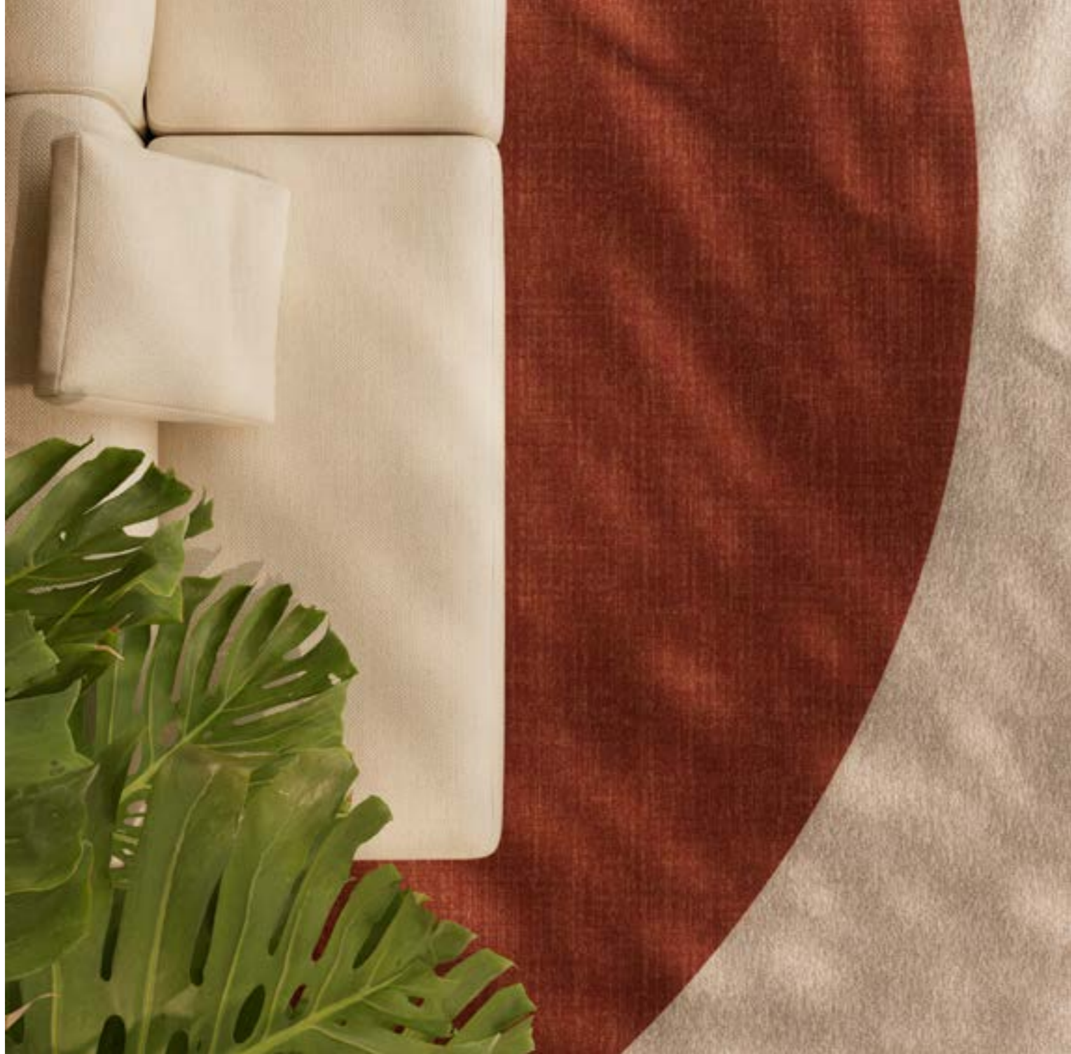
ARTUS 346, FORMA 968