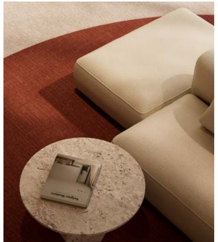
ARTUS 346, FORMA 968